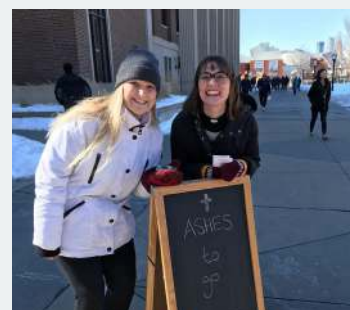
Ashes-to-go on campus