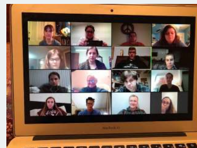
Servant leader meetings