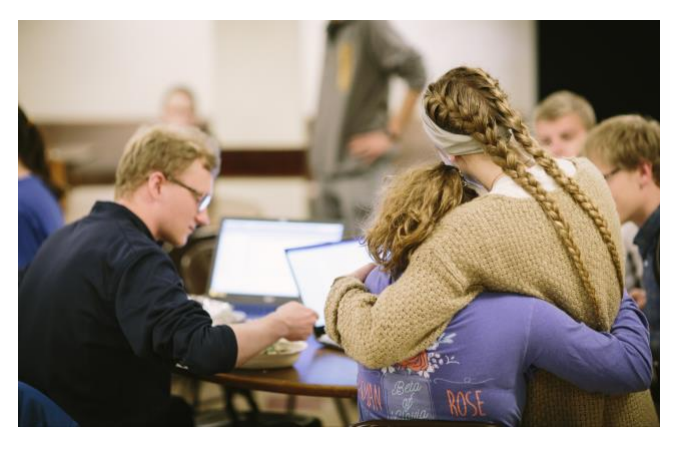
meaningful expression of the partnership between Grace and LCM-TC, and our collective commitment to be "On the Campus for Good."

As we look into the future, we are so grateful to our board, staff, synods, congregational partners and donors for their expertise, hard work, and financial support. You all make LCM-TC a thriving ministry on the campus of the University of Minnesota.